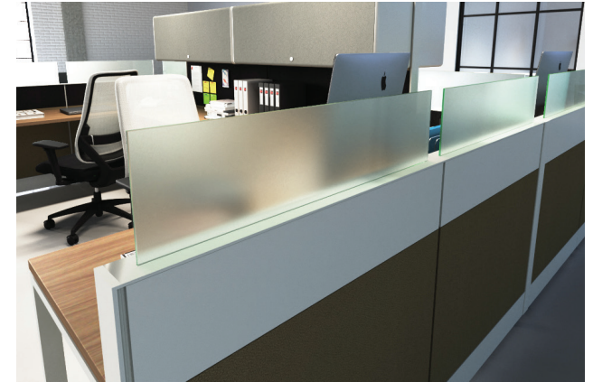
Embedded Crystal Screen

Matis is your solution to create operative and collaborative areas, or floor to ceiling offices; as well as private areas such as boardrooms or training centers.